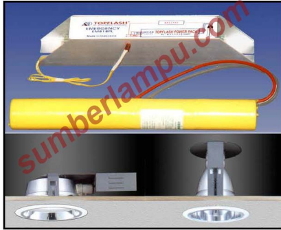
Type: PLC 818